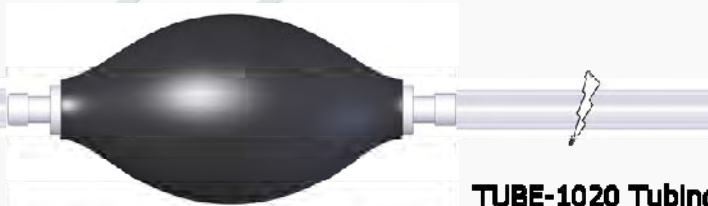
PUMP-1020 Pump, Hand